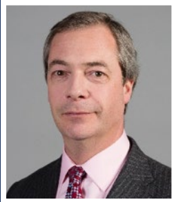
NIGEL FARAGE Architect of Brexit