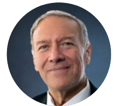
Opening remarks by MICHAEL R. POMPEO 70th U.S. Secretary of State

Olin Fellow, Columbia Law School; Senior Visiting Researcher, Bard College; Tony Blankley Fellow, Steamboat Institute